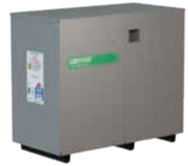
C3, 4, 5 series

C6 Series: The C6 range of heaters are the most efficient heaters in the Convair range, ensuring ultimate comfort and maximum efficiency.